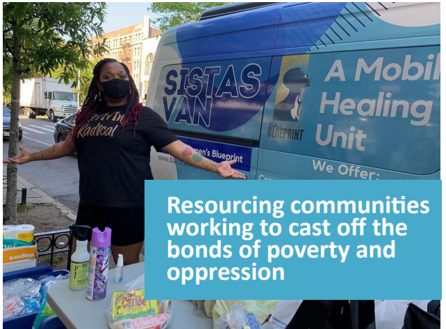
Resourcing communities working to cast off the bonds of poverty and oppression