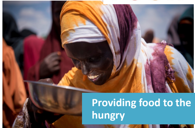
Providing food to the hungry