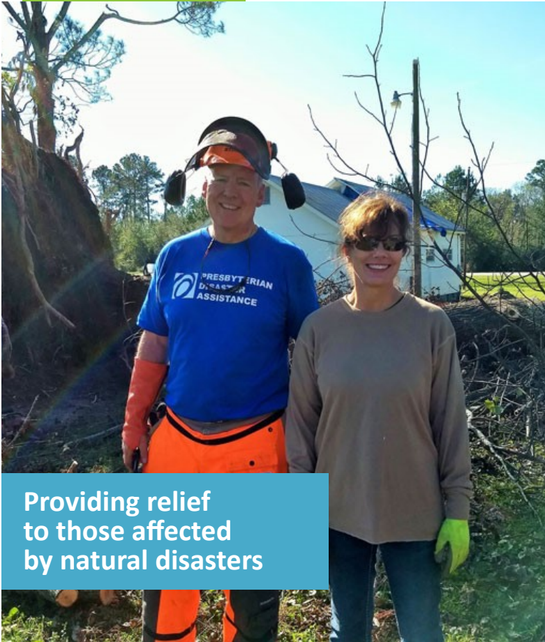
Providing relief to those affected by natural disasters